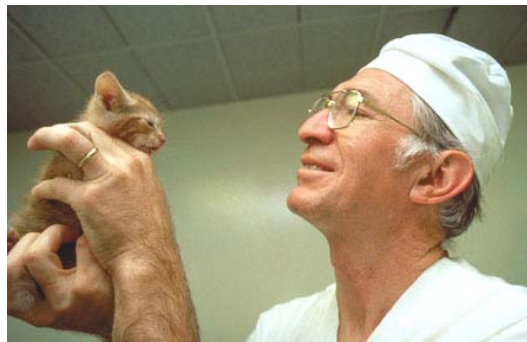
Better science through better management SM

As a result, research inefficiencies, litigation, and other losses because of regulatory non-compliance have resulted in annual penalties and lost opportunity costs of more than $100 million nationally. More than 20 national laboratories have had to suspend operations in recent years because of mismanagement.